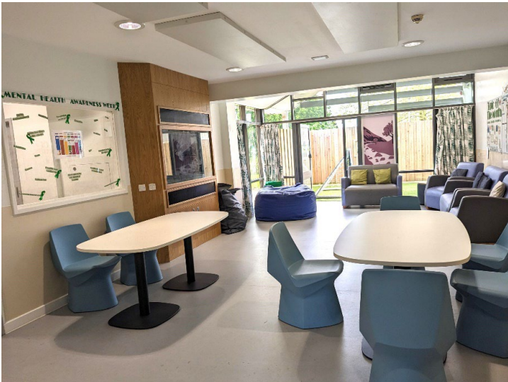
There is a shared lounge and dining area.