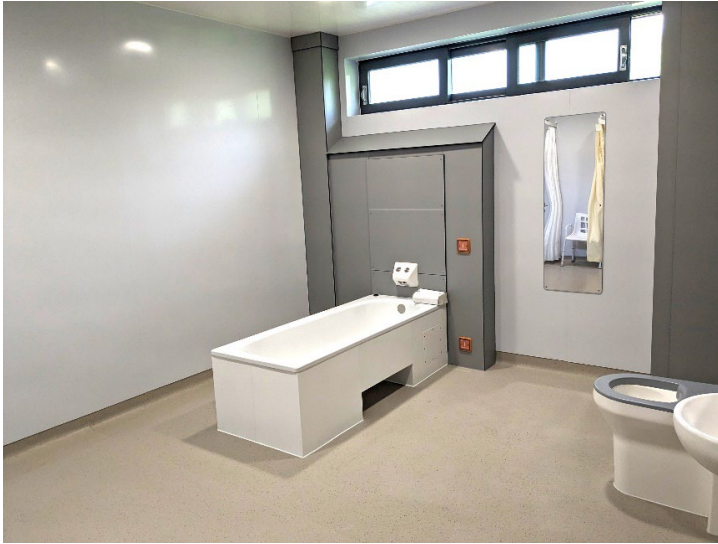
There is a large bathroom.