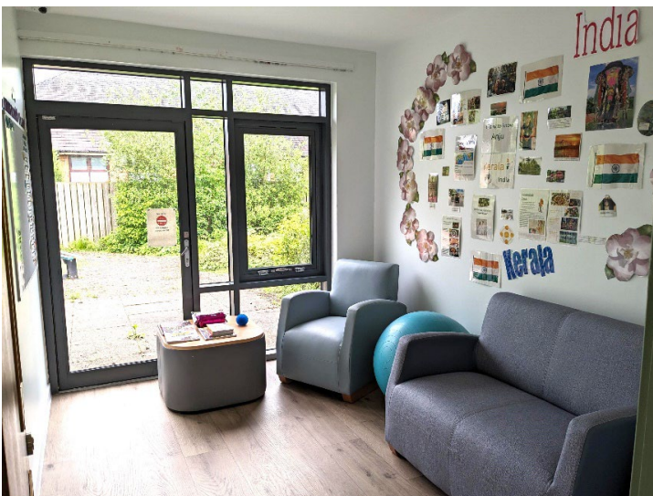
There are separate quiet areas.

You can use these if you want to relax or just to have some quiet time on your own.